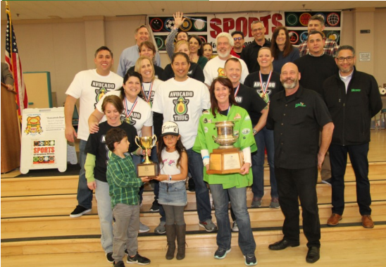
2019 Guacamole Bowl Champions

U.S. Probation-Living The Guac Life—Law Enforcement Div.